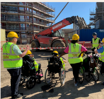
Pictured (below): Oaklands School Site Visit