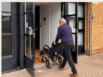
Pictured (above): Pilton Community Centre

During the course of the construction programme, CCG will deliver a wide range of community benefit initiatives ranging from new jobs and apprenticeships to engaging with schools and donating to charities. So far, we have created 5 jobs; 9 apprenticeships; 4 work placements; participated in career days and hosted school tours. We have also donated £15,000 including £10,000 to One City Trust and £5,000 for works in kind to the Pilton Community Centre which received brand new automatic doors to improve accessibility for wheelchair users.